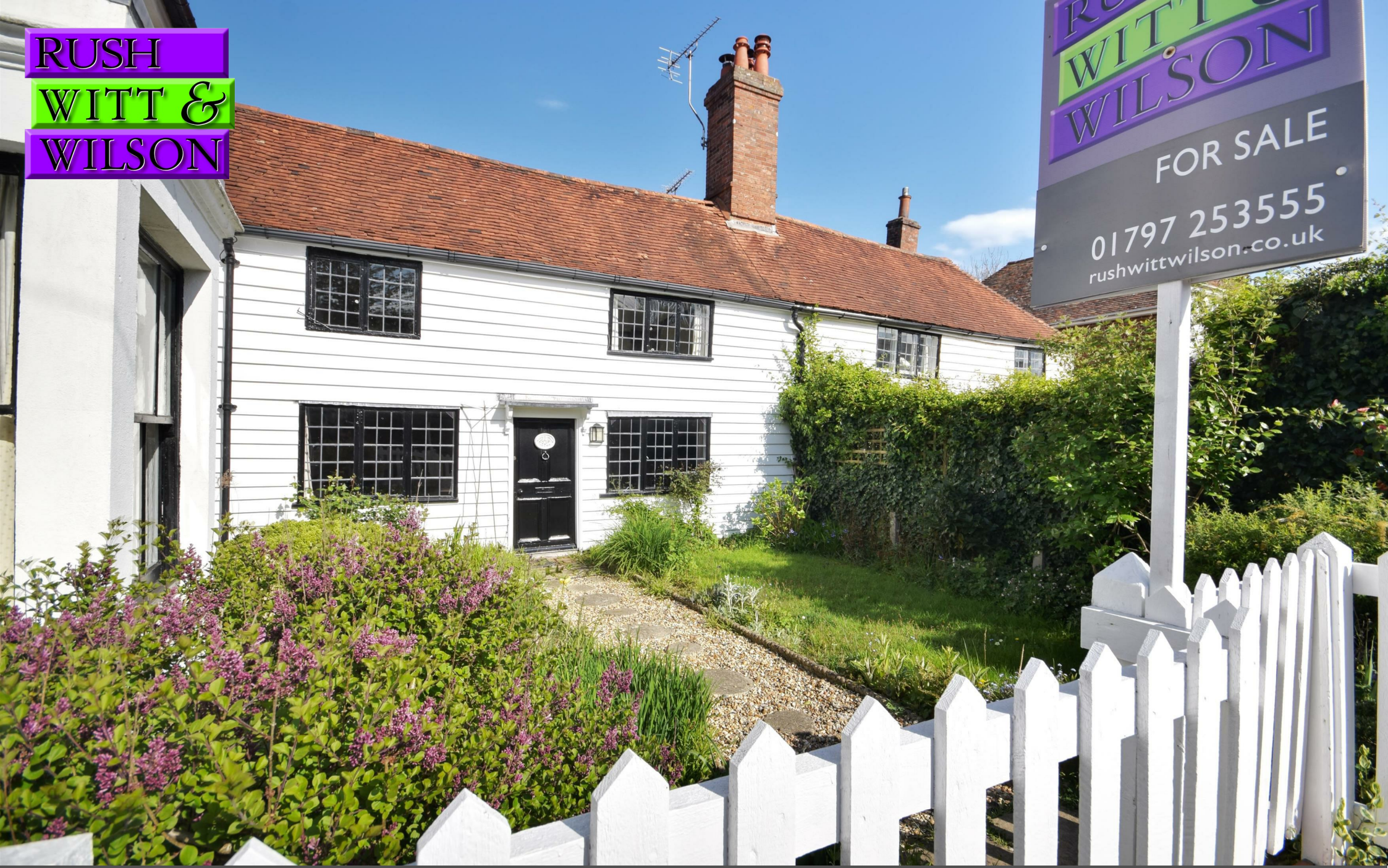
Clench Green Cottage, Main Street, Northiam, East Sussex, TN31 6LP. £325,000 Guide Price.

RUSH WITT & WILSON FOR SALE 01797 253555 rushwittwilson.co.uk